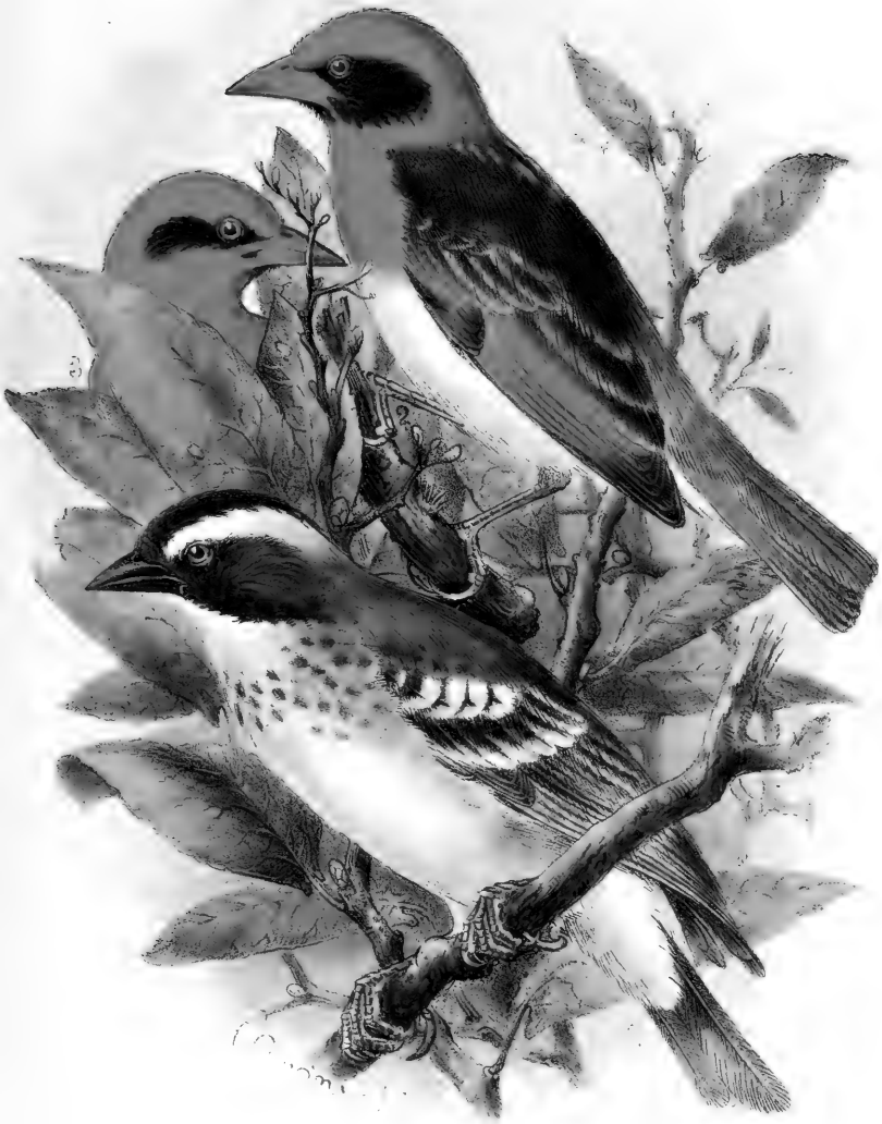
1. Ploceobasser poateralis 2. Anaplectes blundelli . 3. A. erythrogonis